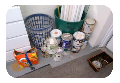
Toxic Taxi (Household Hazardous Waste)