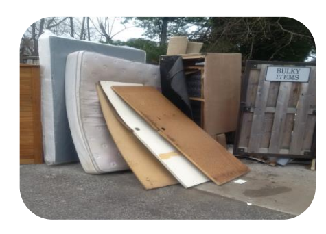
Oversized and Metal Items