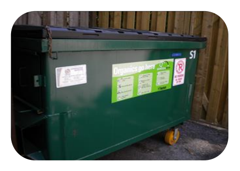
Green Bin Organics